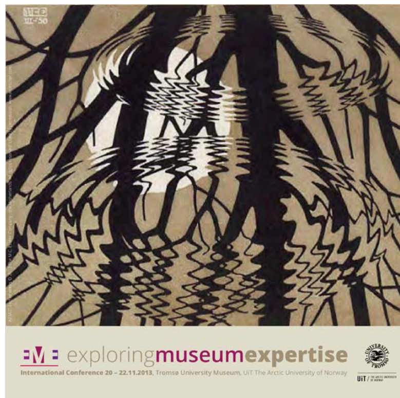
Exploring Museum Expertise International conference, Tromsø

Co-Convenor , International conference in Norway, Tromsø University Museum: Exploring Museum Expertise. November 2013.