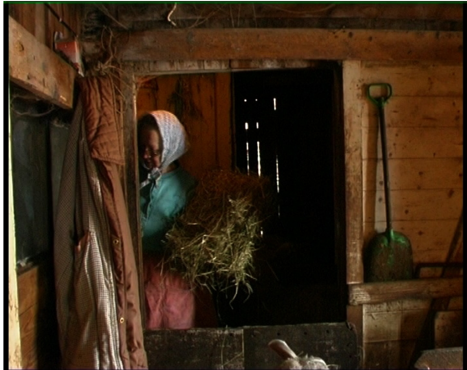
At Home in the World. 2003.