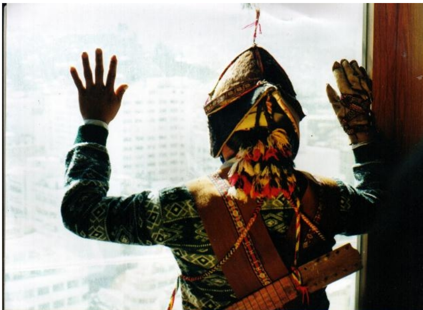
Sayari, Bolivia, 1993.

1993. The ritual of Fertility in the feast of Tinku, Bolivian Andes, where warriors simulate war through individual fights, often leaving one of them dead. Event filmed during preparation and actual ritual in two communities of the Macha area in the Andes, Quechua speaking areas.